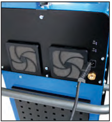
Convenient 110V/220V outlet on back for easy re-charging! Can also be charged while welding. Load test of battery system included.

The Hybrid Spot comes with a variety of extension arms to accommodate any welding job. Switching between extension arms is easy with the Hybrid Spot, simply loosen the handle to pull off the C-Arm & insert the new extension arm.