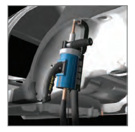
Wheelhouse arm applies consistent welds in difficult areas like the wheelhouse.