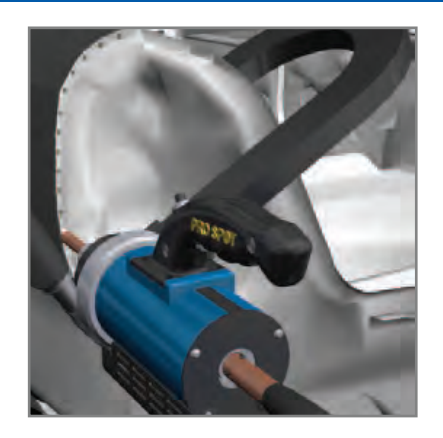
300mm & 600mm optional arms available to weld in hard to reach areas.